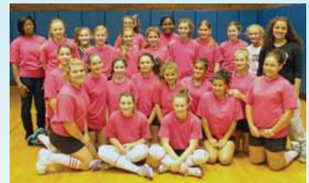
Washington Middle School Girls' Volleyball Team

Proceeds from their events such as the golf tournaments, galas and basket drawings allow the MidState Auxiliary to make significant contributions to MidState. Their latest gift supported the creation of the Auxiliary Cancer Boutique .