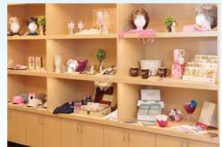
MidState's Auxiliary Cancer Boutique