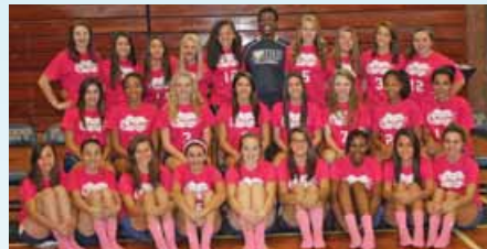
O.H. Platt High School Girls' Volleyball Team

Wallingford Firefighters (Local 1326) donated proceeds from a 90-mile motorcycle Poker Run through scenic Connecticut.